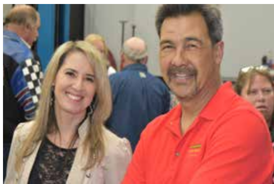
A couple of our hosts