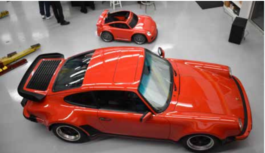
I'll take the standard and the mini-me, please!