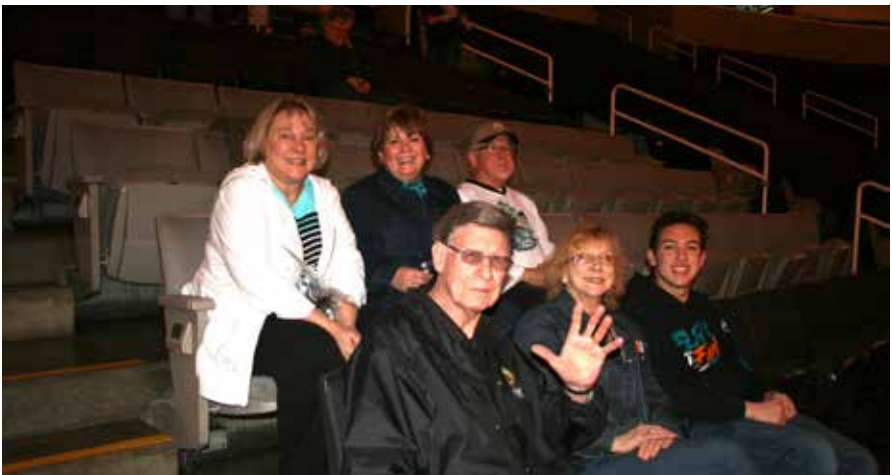
“The Magnificent” Eight