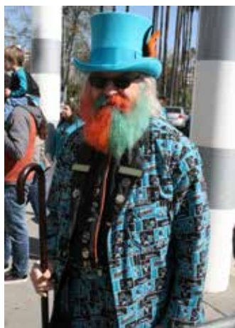
A very colorful Barracuda fan

My knowledge of hockey is quite limited, much to the chagrin of my father when I was growing up. I think that hockey is some sort of regional religion in Michigan's UP. Saturdays were spent huddled in the basement watching the NHL on a 15 inch black and white TV. A Motorola, as I recall.