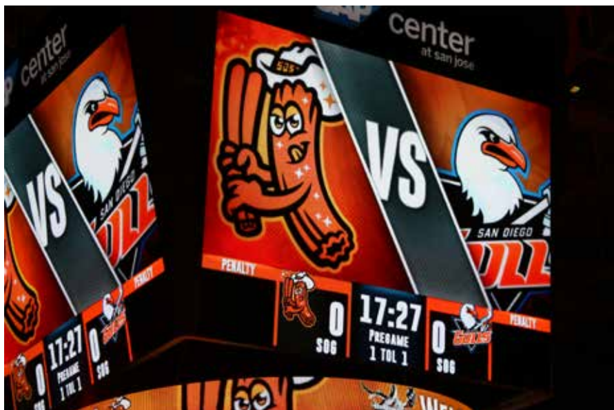
Barracudas Game February 29, 2020