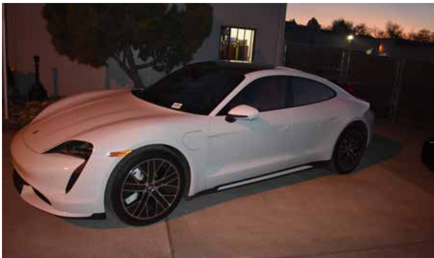
The new Taycan