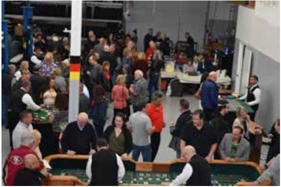
A mix of Shelby, Corvette and Porsche attendees

First, and perhaps most importantly, there was a full open bar where one could enjoy anything from a Martini to a Manhattan, beer and wine, and sodas too.