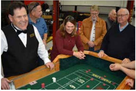
PLEASE roll my numbers!