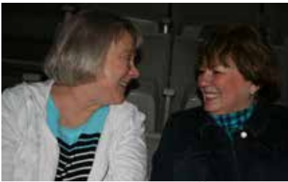
Was THAT a goal?