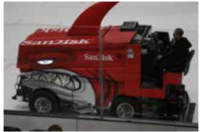
The Zamboni doing it's job

If you haven't seen a hockey game in person, you have no idea about how FAST the game is. I missed goals, penalties, and line changes (I never saw the lines on the ice, blue as I recall, being changed, but I guess they must have – maybe they transitioned to some color that I don't see).