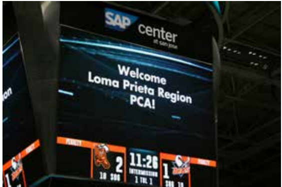
Welcoming the LPR PCA at the Shark Tank

We had the run of multiple rows in the GA (General Admission – not Greatest Attendees) section of The Tank. We could spread out and enjoy the spaciousness of the rows. Fortunately, the LPR'ers sat more or less together which did cut the cold a bit (I think that huddling together for warmth is something that no Bay Area Californian understands).