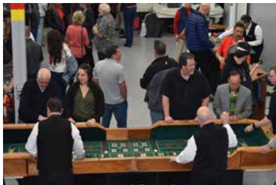
Quite a few tables to play

After an hour or so the call for chow rang out across the room and folks migrated to the C.A. side for an absolutely great assortment of Mexican food that included tacos, quesadillas, rice, beans, chips and salsa provided by La Taquiza Zarape in Redwood City. All of their cooking was done indoors, so just stepping into the C.A. shop gave everyone an