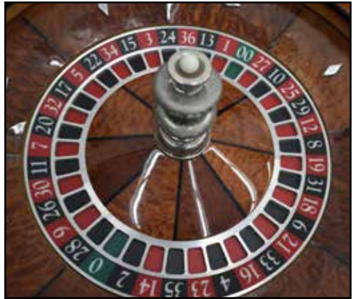
Roulette anyone? (page 14)

Loma Prieta Region - PCA P.O. Box 0705 Santa Clara, CA 95052-0705