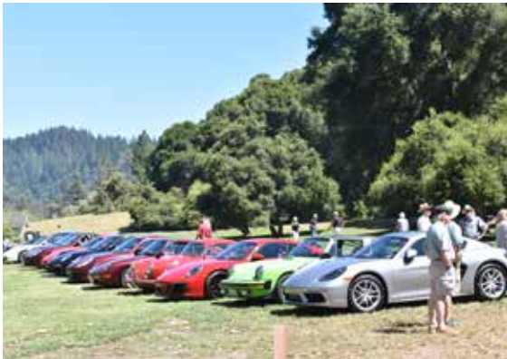
Impromptu Concours at the Picnic

Toot! Toot! Pssh! In comes the old steam engine at Roaring Camp Station. As the Morning progresses more and more Porsche's mosey in. Soon, the line of cars parked in the grass grows in a beautiful and colorful rainbow of thirty-five cars ranging across 40 years.