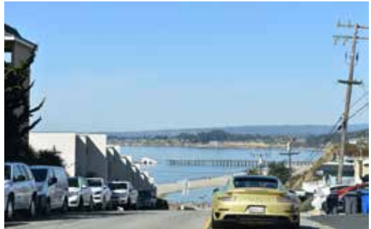
On the way to Watsonville

After the tour, we headed into the pristine agriculture lands of Watsonville. Each unique crop stood out from the rest. Cruising along the San Andreas Road soon brought us to La Selva Beach, with views of the oceans and Seascape Resort. Onward we drove entering Rio Del Mar and an interesting traffic drive up Spreckles Drive. Highway One had an accident and lots of drivers thought to escape on to Soquel Ave. Bad choice, they soon learned!