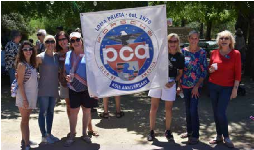
Some of the women including board members of Loma Prieta PCA!