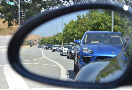
Left: One can't help thinking that whoever took this picture should have had the consideration to pull over and let all these cars, backed up behind him, to pass.