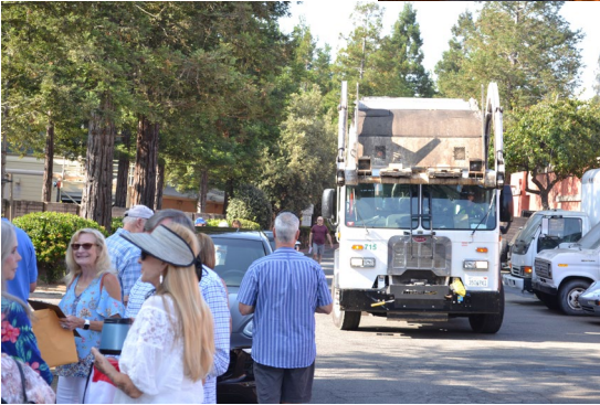
Left: There was a little bit of a buzz at the gathering point. Was there really going to be a garbage truck on this tour?