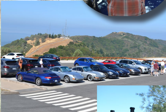
Left: The tour is parked with the drivers having to deal with the 176 steps that led up to the park facilities and the fabled square, concrete edifice visible from the valley floor.