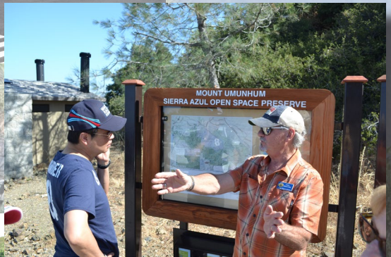
Right: Yup... he's still doing it, this time at the top of Mt. Umunhum.