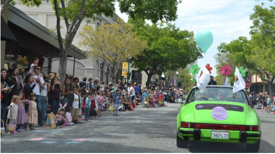
The turnout for the Campbell Easter Parade has grown to where it spills out onto the street.