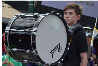
What is he beating his drum about? page 14.