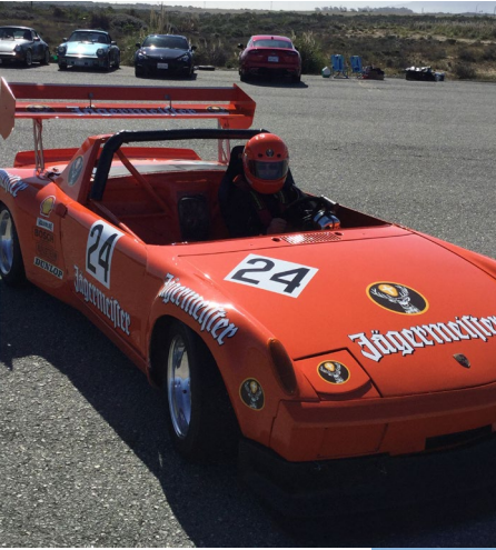
Left: I don't imagine that there are many original 914s left... so many have been modified.