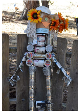
Strange encounters on the Trains, Trolleys and Beans? Tour. More on page 24.