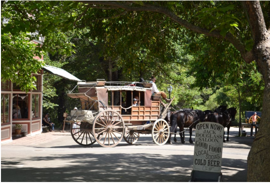
In Columbia it's possible to run into some really underpowered vehicles... four horsepower!

After about 20 minutes we headed out again traveling east on CA-4 through fields with cows and rolling hills. We went south on Parrots Ferry Road to the town of Columbia. From there we took