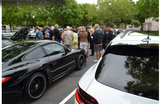
Right: ... as the group gathers around and listens intently.