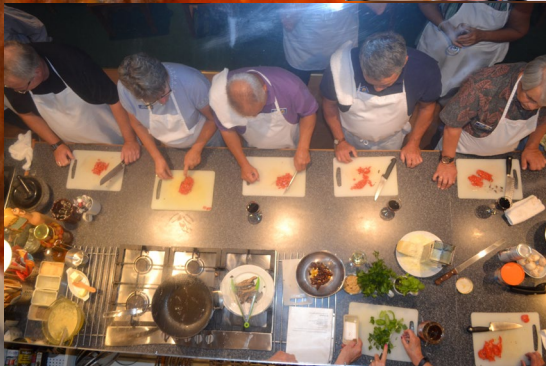
Above: An aerial view of the crew playing dice... dicing tomatoes, that is.